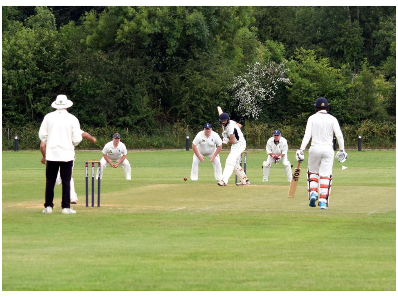
Cricket at Warminster Road, home of Division 6 champions Sheffield University Staff