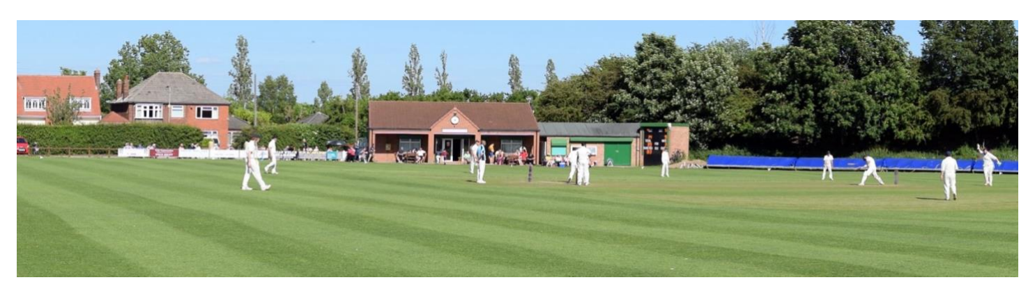
The ground at Common Lane, Warmsworth