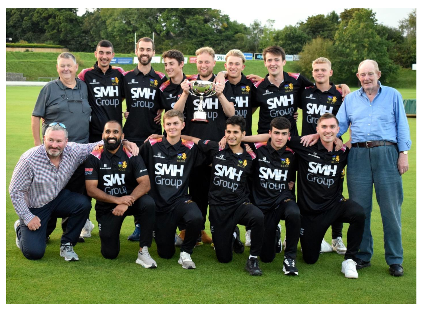
YCSPL champions Sheffield Collegiate CC