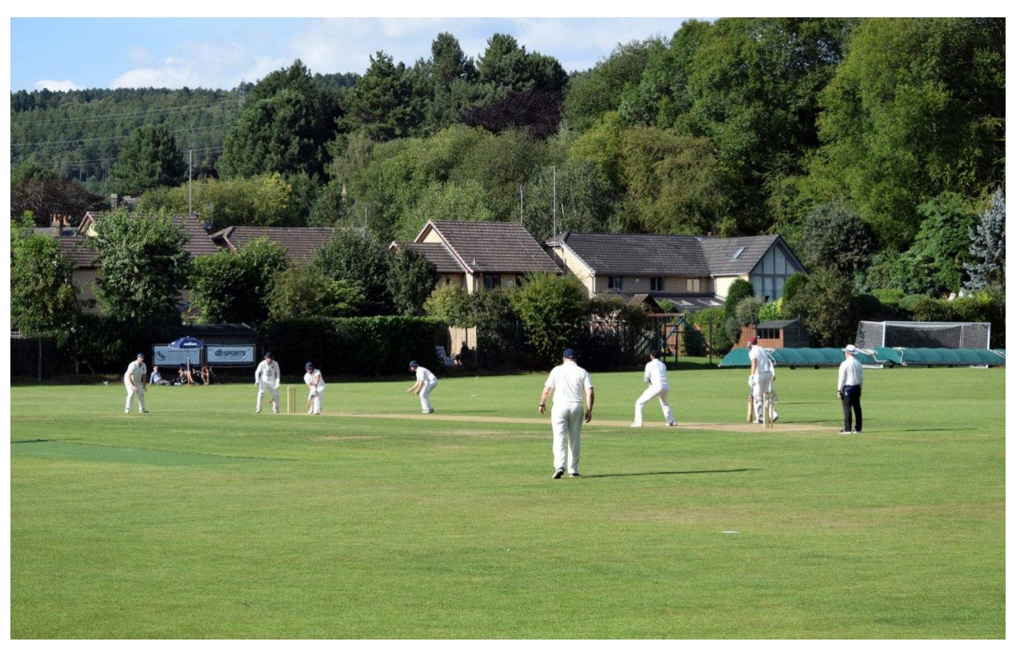
Waterside Gardens, Oughtibridge