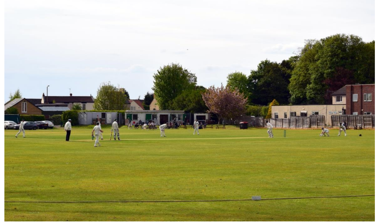
Cricket at Hatfield Town CC