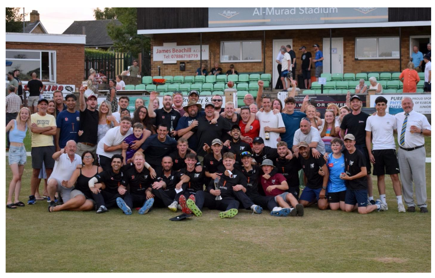
Barnsley Woolley Miners CC – T20 Blast Champions 2022