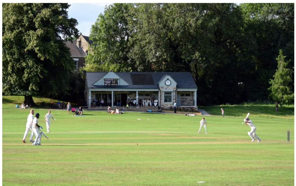
The new pavilion at Millhouses Works CC