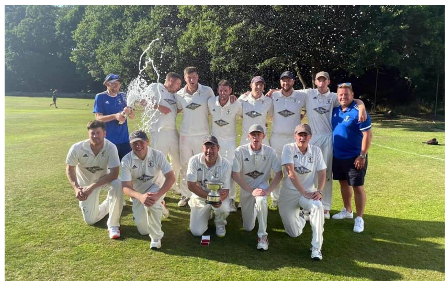
Elsecar CC – President's trophy winners 2022