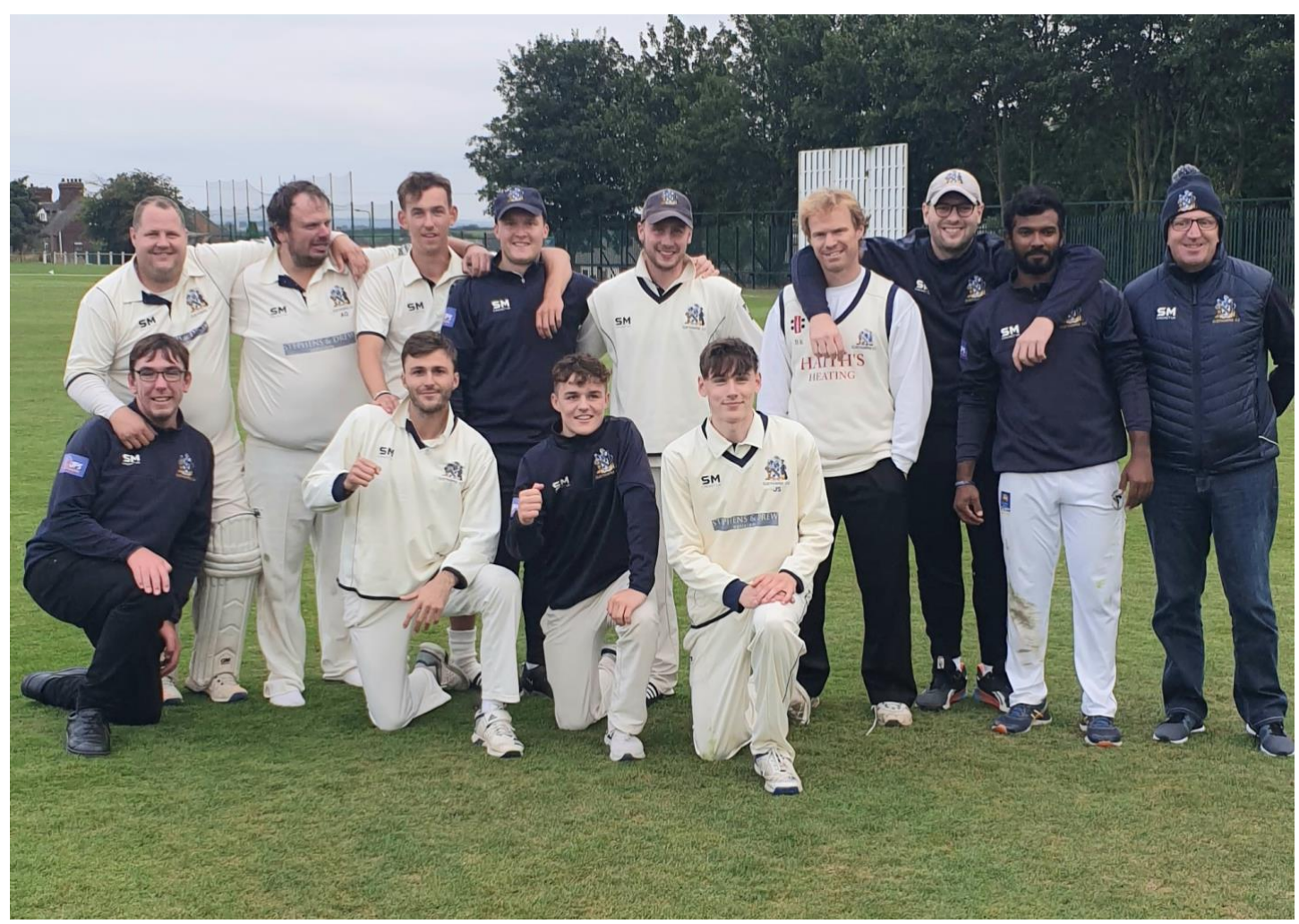
Cleethorpes CC, Championship Division champions 2021